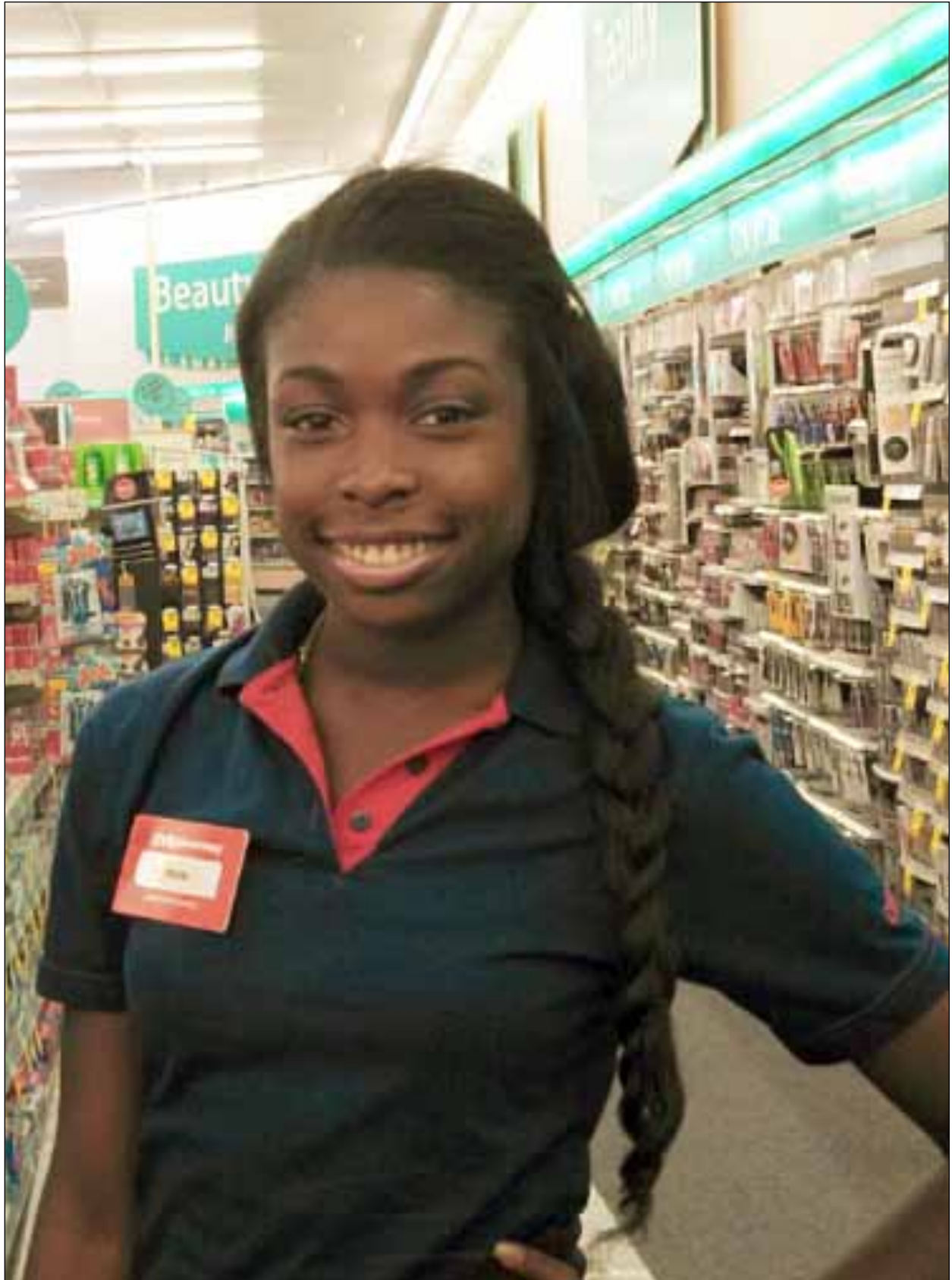
El Proyecto YouthSource provide comprehensive employment and training services for youth ages 16-24.