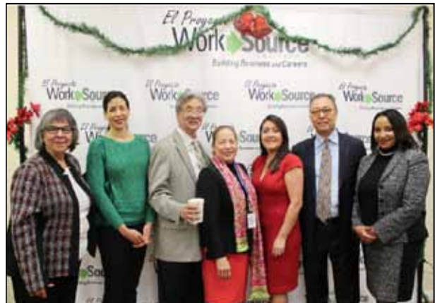
With Assemblymember Luz Rivas