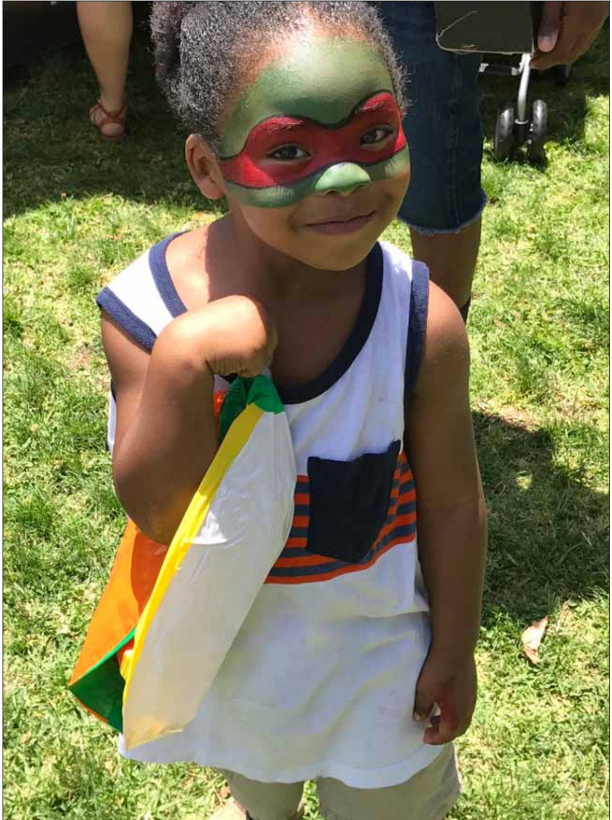
El Proyecto del Barrio participates in many community health and workforce development events annually.