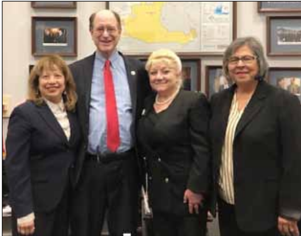
With Congressman Brad Sherman