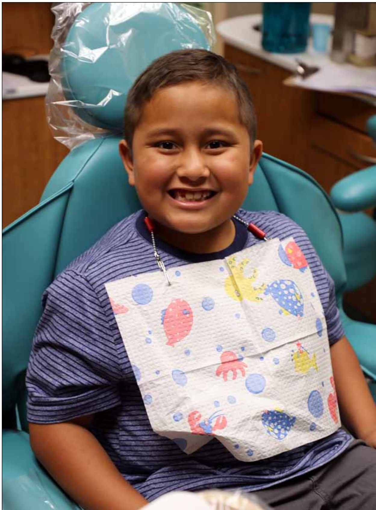
A young patient prepares for his first treatment at El Proyecto del Barrio's new 8-chair Dental Clinic in Arleta.