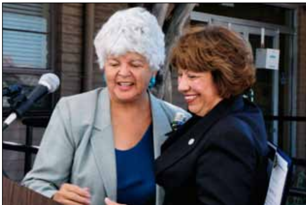
With Congresswoman Grace Napolitano