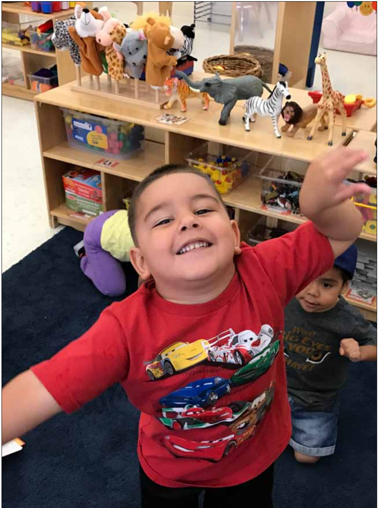
El Proyecto del Barrio's Child Development Centers nurture and inspire children's individual growth and creativity.