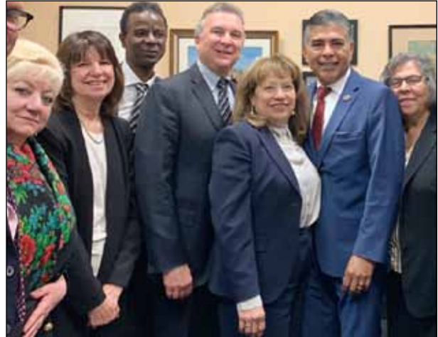
With Congressman Tony Cárdenas