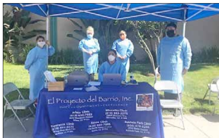
El Proyecto Staff members utilize Personal Protective Equipment (PPE) to provide medical services to the homeless population at the temporary shelter at Bassett Park in La Puente. Los Angeles County Supervisor Hilda Solis opened the 24-hour winter shelter. El Proyecto clinics in Azusa and Baldwin Park provided staffing and immediate medical services.