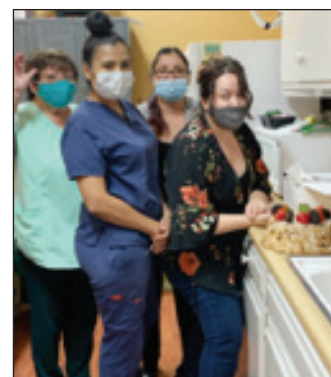
Each of our El Proyecto del Barrio employees is a Hero!

Our employees are committed to providing quality care to our patients every day. During the COVID-19 pandemic, they are on the frontline to serve our communities. National Health Center Week's Staff Appreciation Day was the perfect time to demonstrate our appreciation to our team by providing lunch.