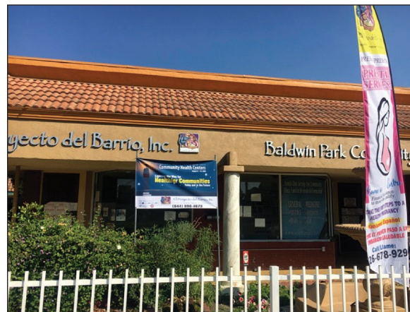
National Health Center Week signage was displayed prominently at all El Proyecto health care sites.

El Proyecto has provided quality social services and medical care to our communities for almost 50 years. Because of the COVID-19 pandemic, the observation of National Health Center Week is significantly different from past celebrations. Previously we held in-person community celebrations and hosted state and local officials and Congressional representatives at our clinic sites.