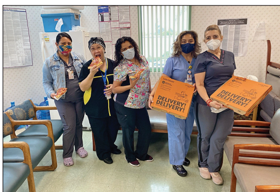
Pizza was supplied for lunch for all El Proyecto clinic and Program locations to honor staff for their dedication.